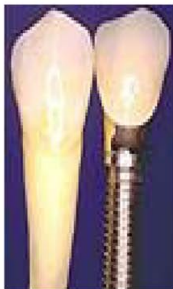
Crown on implant