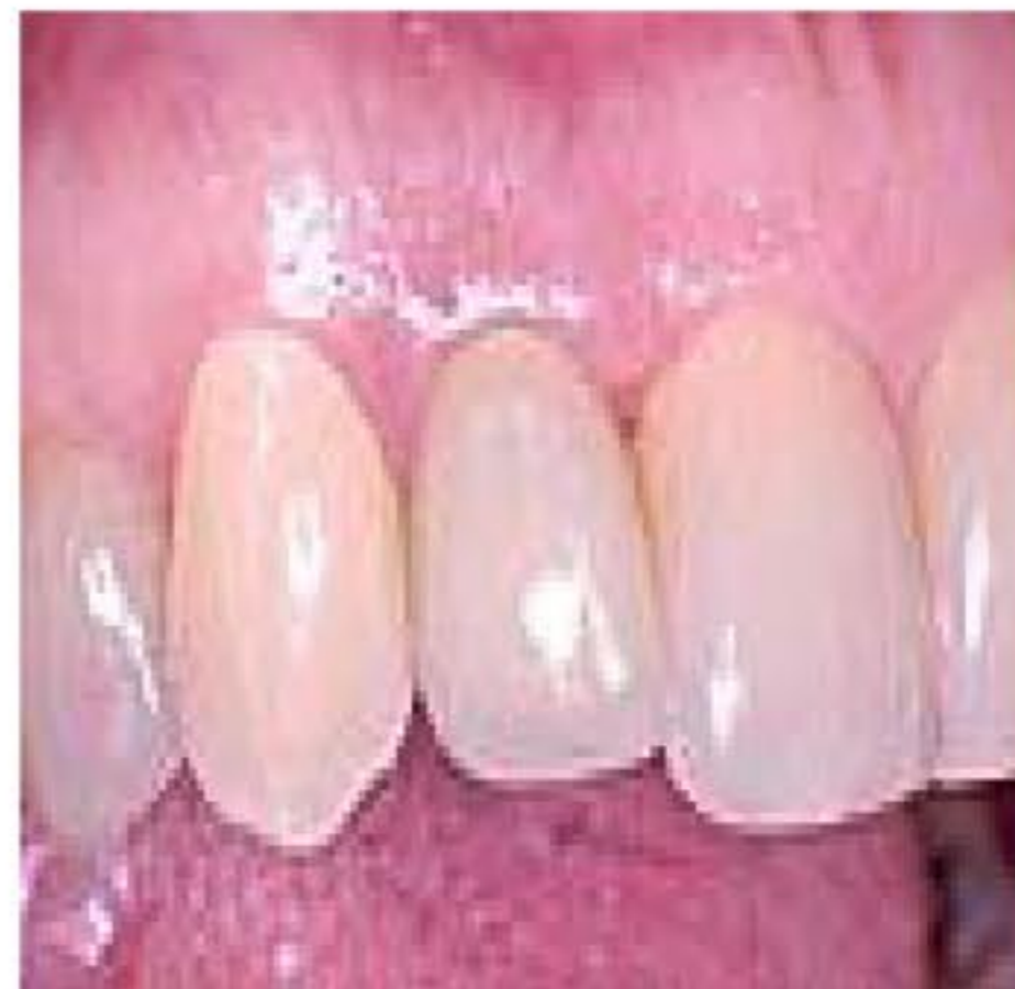
Crown on implant