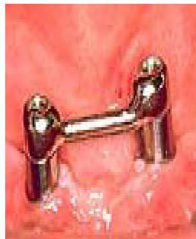
Implants + bar for a denture